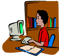
Research, Projects, Powerpoints, web quests